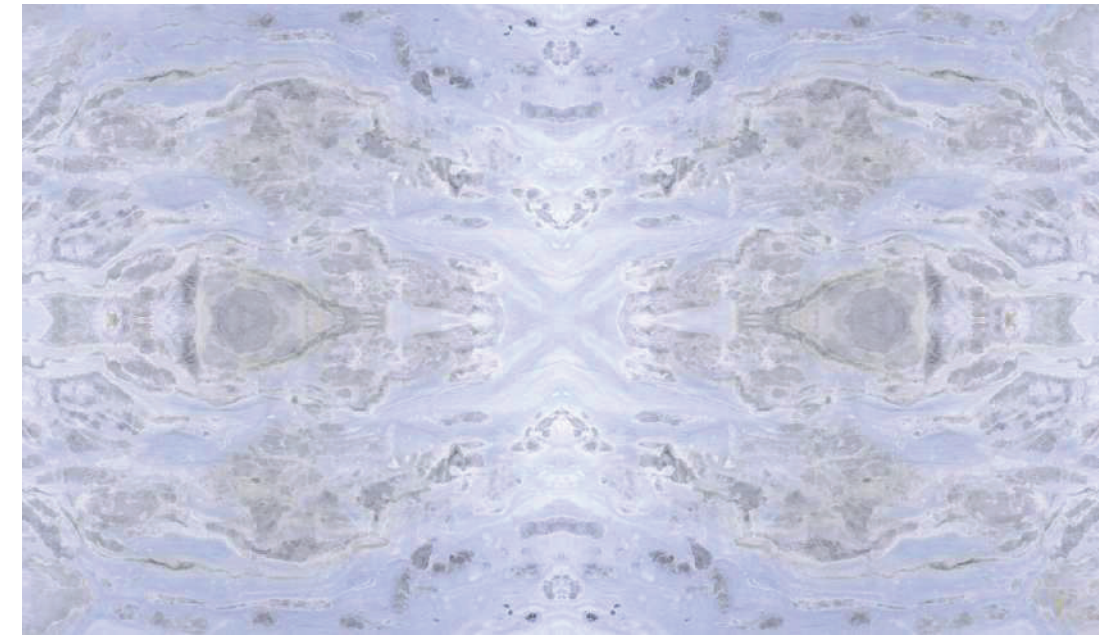
Blue River Aré Marble