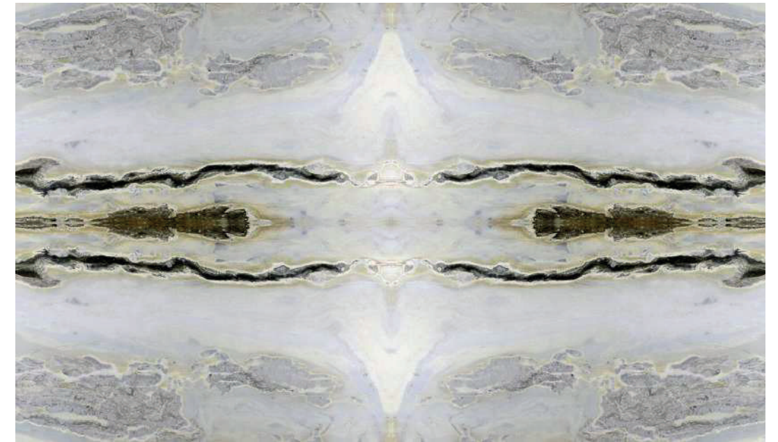
Black Ink Aré Marble